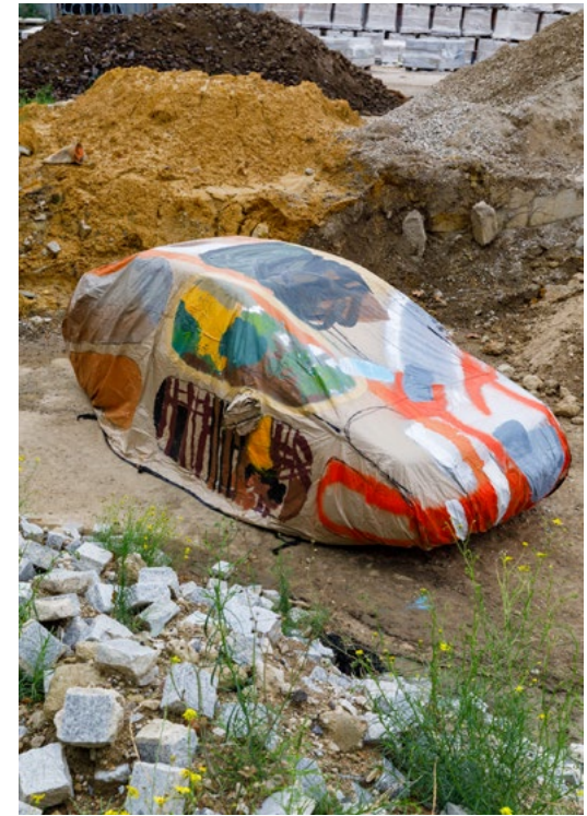
Motorama 360 Boulogne + Clichy (acrylic paint and solvent-based lacquer on car covers), 2024