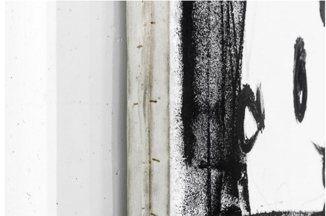
Gesture memorization exercise. Paintings made in 1 minute from sketches made beforehand.